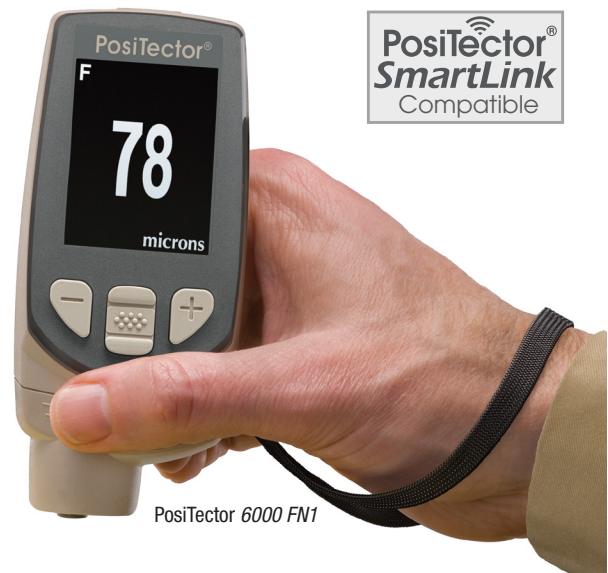
PosiTector 6000 FN1

FN probe for measuring coating thickness on ferrous and non-ferrous metal substrates. Ideal for measuring coating thickness on steel, iron, aluminum, copper and more.