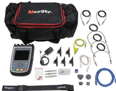
MPQ1000 Basic Kit C/N MPQ1000-BASIC

Includes MPQ1000 analyzer, voltage leads, SD card, USB cable, ethernet cable, universal power adapter, soft-sided carry bag plus fuse adapters and hanging strap. Does not include current clamps.