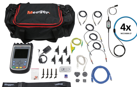
MPQ1000 Gold Plus Kit C/N MPQ1000-G-KIT-PLUS

Includes MPQ1000 analyzer, voltage leads, SD card, USB cable, ethernet cable, universal power adapter, soft-sided carry bag, plus hanging strap, voltage lead plunger clips, and 3 MCCV6000-18 (four range flex 18 cm ID) CTs