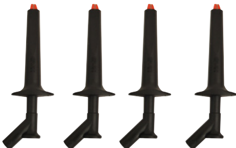
Optional Plunger Clips (1008-756)