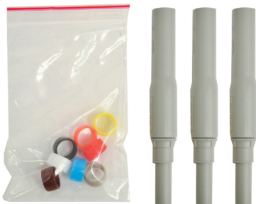
Optional Fuse Adapter Kit (1008-645)

Includes 4 adapters with multiple color straps.