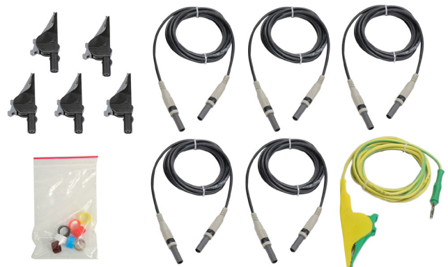
MPQ1000 Voltage Lead Set (2007-259)