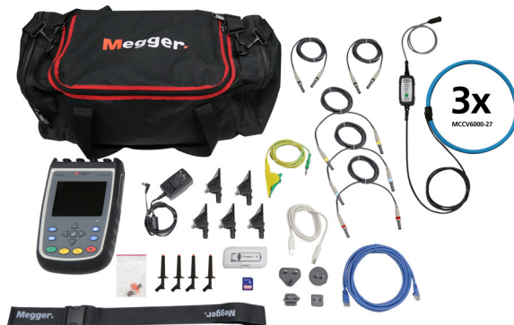
MPQ1000 Gold Kit C/N MPQ1000-G-KIT

Includes MPQ1000 analyzer, voltage leads, SD card, USB cable, ethernet cable, universal power adapter, soft-sided carry bag plus fuse adapters and hanging strap. Does not include current clamps.