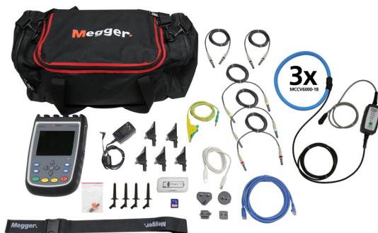
MPQ1000 Silver Kit C/N MPQ1000-S-KIT

Includes MPQ1000 analyzer, voltage leads, SD card, USB cable, ethernet cable, universal power adapter, soft-sided carry bag, plus hanging strap, voltage lead plunger clips, and 3 MCCV6000-27 (four range flex 27 cm ID) CTs