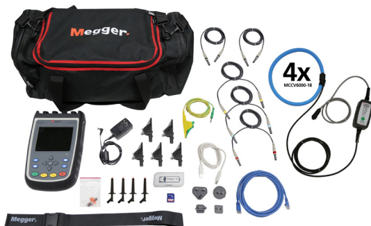
MPQ1000 Silver Plus Kit C/N MPQ1000-S-KIT-PLUS

Includes MPQ1000 analyzer, voltage leads, SD card, USB cable, ethernet cable, universal power adapter, soft-sided carry bag, plus hanging strap, voltage lead plunger clips, and 4 MCCV6000-27 (four range flex 27 cm ID) CTs