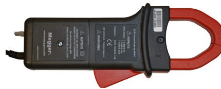
Hall Effect Current Clamp 600 A dc and 400 A ac (CP-600DC-ID)